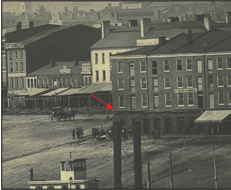
From GEH 16X of plate 2.

plate 2, Joe's coffee house was located in the building in the center, the left-most corner of Cassilly's Row. The deeper main Public Landing is to the left, where the carriage is. According to The Cincinnati Panorama of 1848 brochure from the Public Library, 98 Stephen Foster, composer of Oh! Susanna and My Old Kentucky Home , was working as a steamboat clerk a few doors to the east (right) of where Joe's coffee house was.